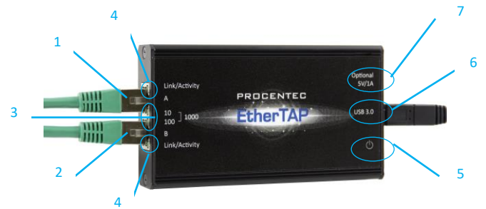
Figure 2. Identification of connections and LEDs for the 1Gbit version