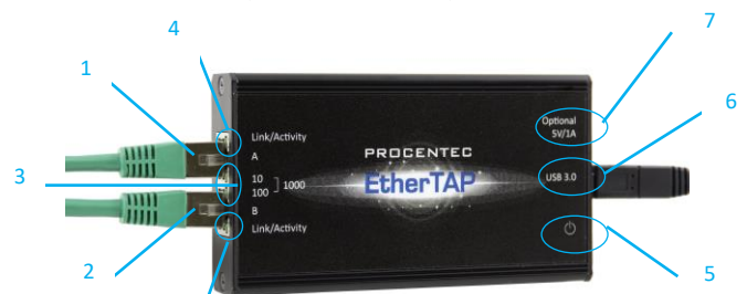
Figure 1: Identification of connections and LEDs for the 100 Mbit version